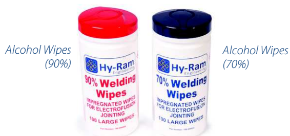
Alcohol Wipes (90%)