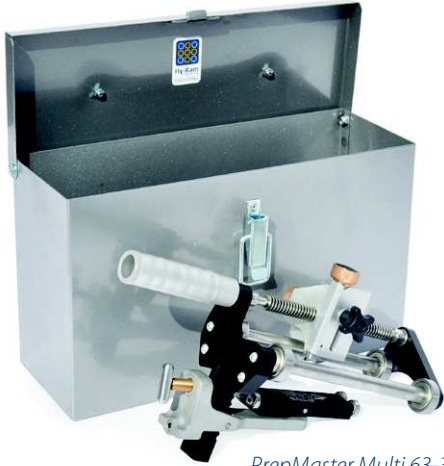
PrepMaster Multi 63-325mm