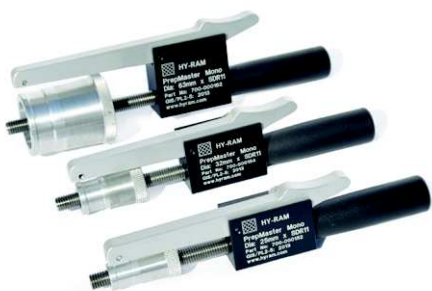
PrepMaster Mono Range