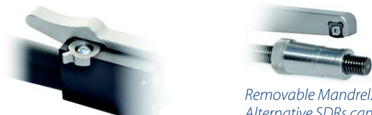
"One Touch" Blade Lock Off Mechanism