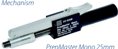
PrepMaster Mono 25mm